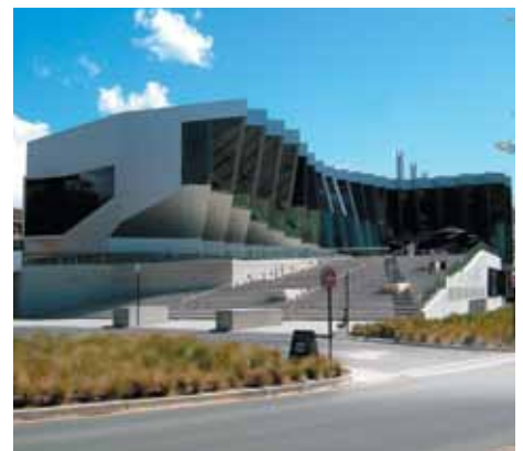
Right: John Curtin School of Medical Research, Canberra, Australia