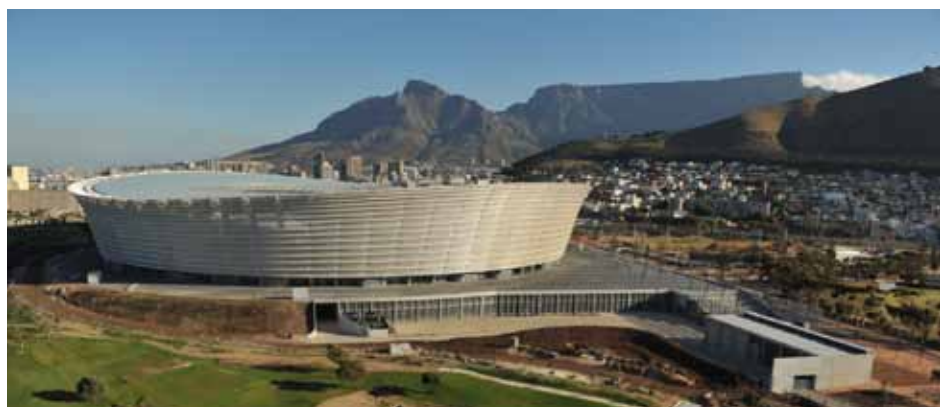
Bottom: Green Point Stadium, Cape Town, South Africa