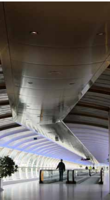
Top: Gautrain Rapid Rail Link, Gauteng, South Africa