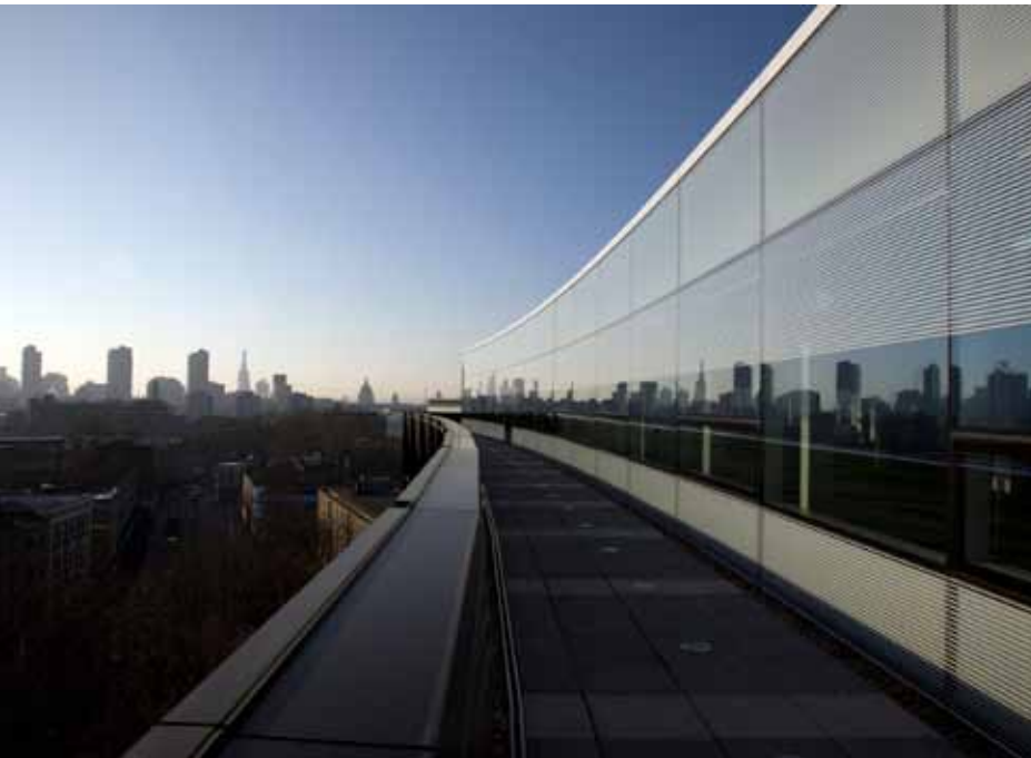
Top: Abu Dhabi International Airport, Abu Dhabi, U.A.E.

And, while our roots are in technical delivery, our clients also value the fact that our services always contain a strategic component. We operate beyond the project level and support our clients' long-term business plans and strategies.